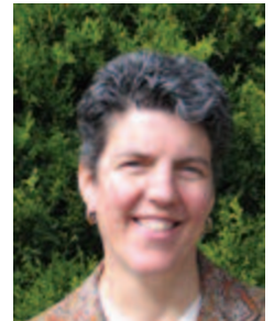
Faith Baum Illumination Arts LLC